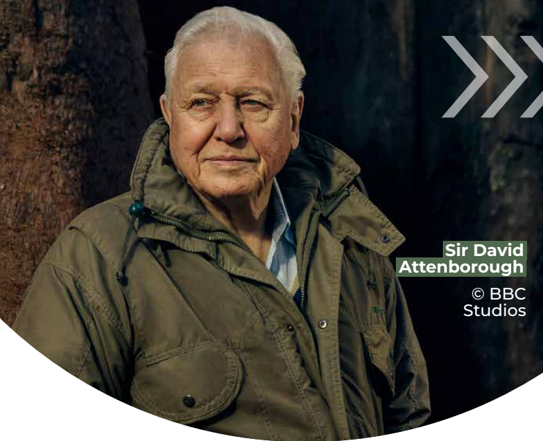
Sir David Attenborough